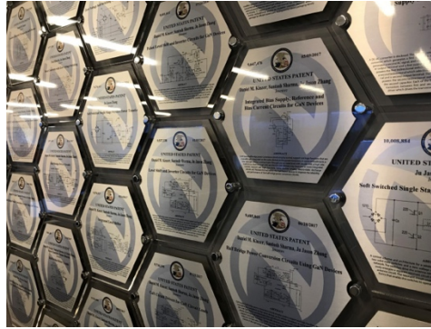
Figure 1: Over 130 patents and significant company secrets give Navitas a multi-year lead in gallium nitride

This experience has been fundamental to building a company that is at the forefront of a second power revolution - helping customers address design and sustainability goals by migrating from slower, legacy silicon semiconductors to faster, more efficient gallium nitride (GaN)-based solutions.