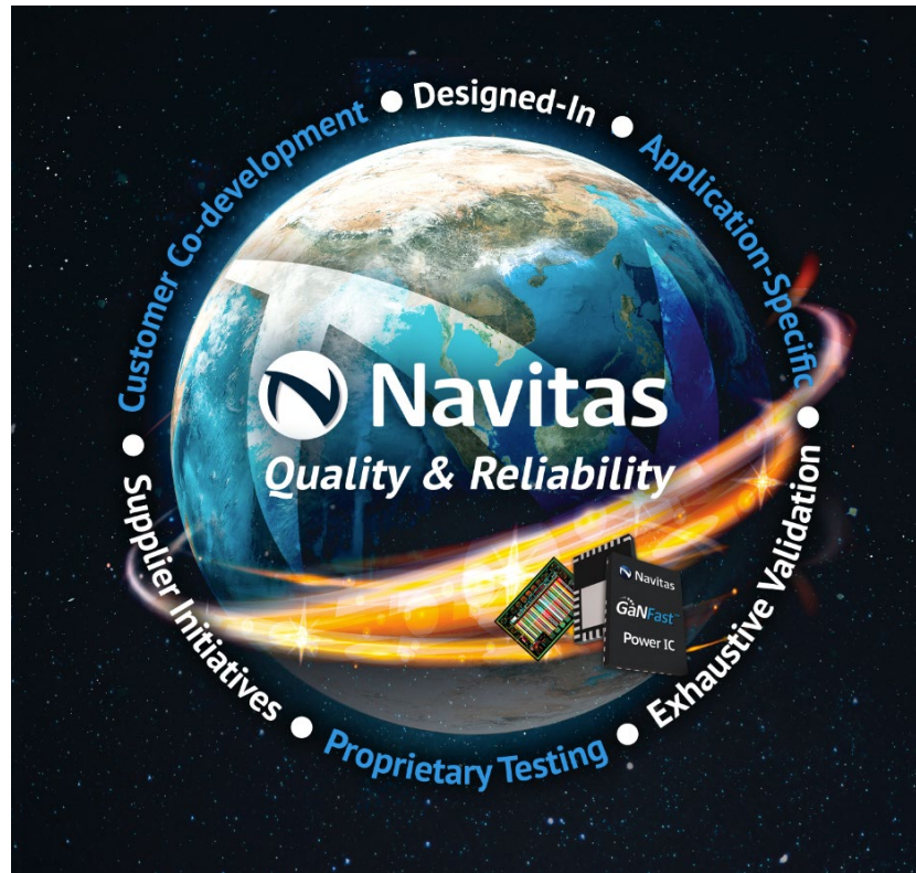
Figure 3: Six key elements of the Navitas quality philosophy